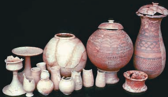
Pottery from a grave at Harappa.