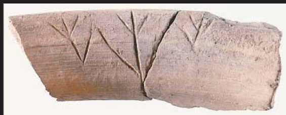
Potsherd with incised triple-trident sign found in early levels at Harappa and dating sometime between 3500 and 2800 BCE.

In order to prove that the Indus civilisation was Aryan, the language has to be deciphered as a form of Sanskrit and there has to be evidence of an Aryan presence, which currently is being associated with