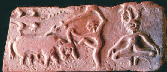
Small terracotta tablet from Harappa depicting part of a mythological scene. Combat between human and animal or animal and animal is often depicted.